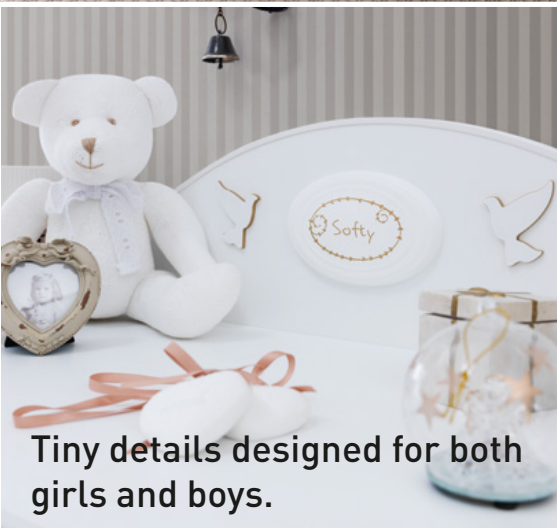
Tiny details designed for both girls and boys.