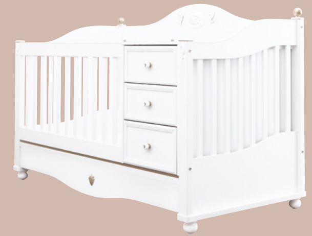
Convertible Baby Bed

W 142 x H 78 x D 115 cm 2 Package • 58 kg • 0,262 m 3 20.23.1009.01