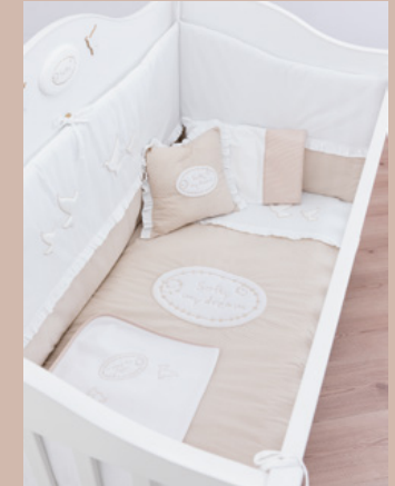
Single Plus Bedding Set

W 440 x H 200 cm 1 Package • 3,5 kg • 0,018 m 3 20.23.4913.00