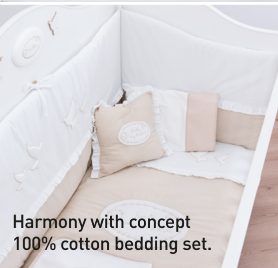
Harmony with concept 100% cotton bedding set.