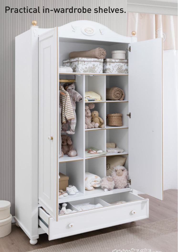
Practical in-wardrobe shelves.