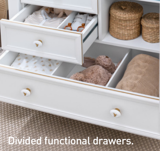
Divided functional drawers.