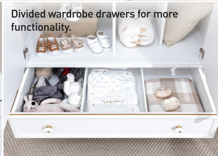
Divided wardrobe drawers for more functionality.