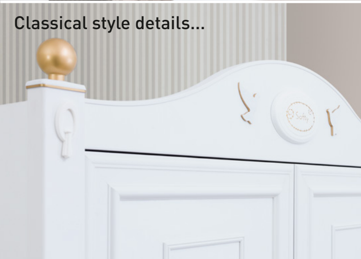
Classical style details...