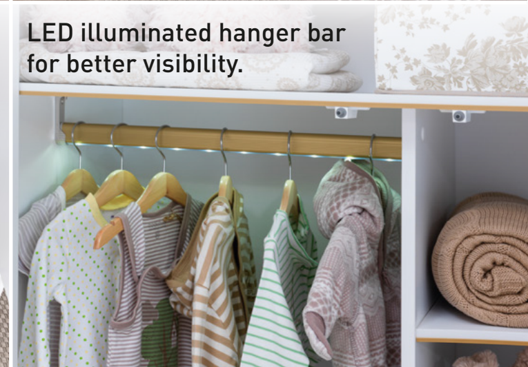
LED illuminated hanger bar for better visibility.