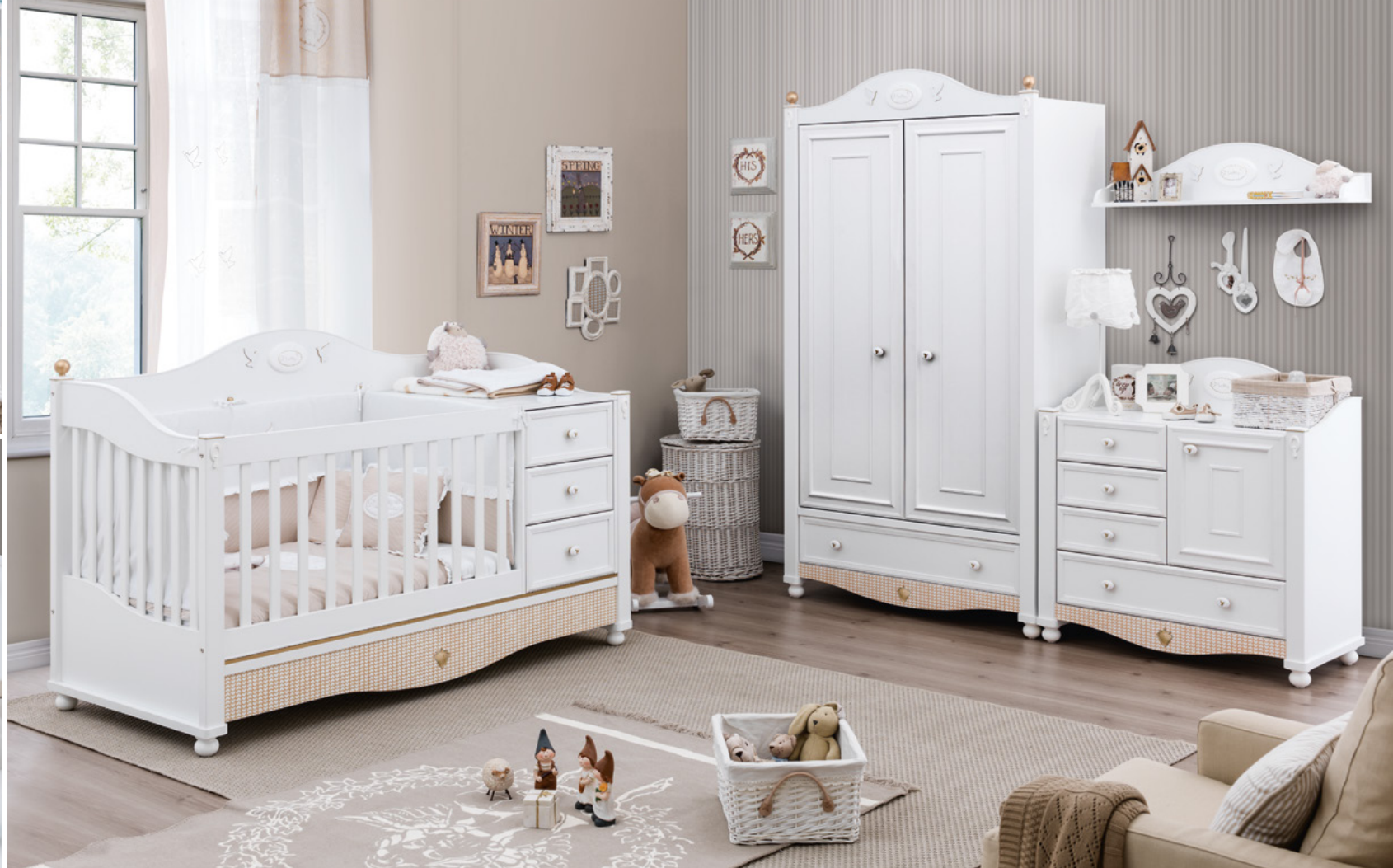
Convertible feature enables use up to 6 years old.