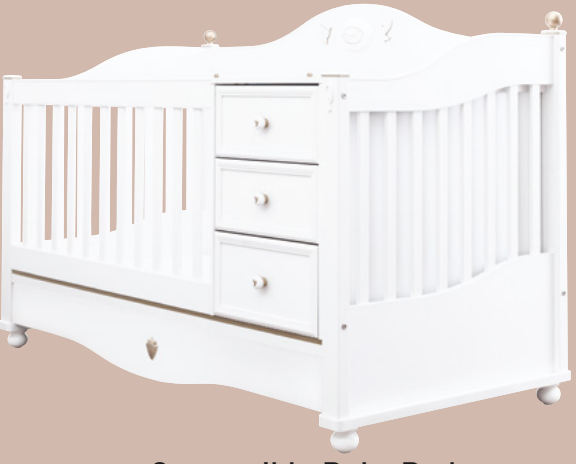
Convertible Baby Bed

W 112 x H 210 x D 55 cm 4 Package • 123 kg • 0,288 m³ 20.23.1001.01