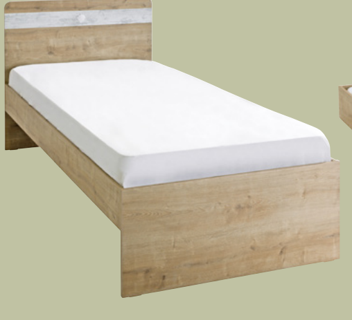
Standard Single Bed (90x190 cm) W 94 x H 95 x D 193 cm 3 Packages • 45,5 kg • 0,11 m<sup>3</sup>