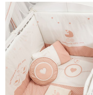
Romantic Baby Bedding Set W 80 x D 130 cm 1 Parcel • 2,6 kg • 0,068 m 3 21.03.4158.00