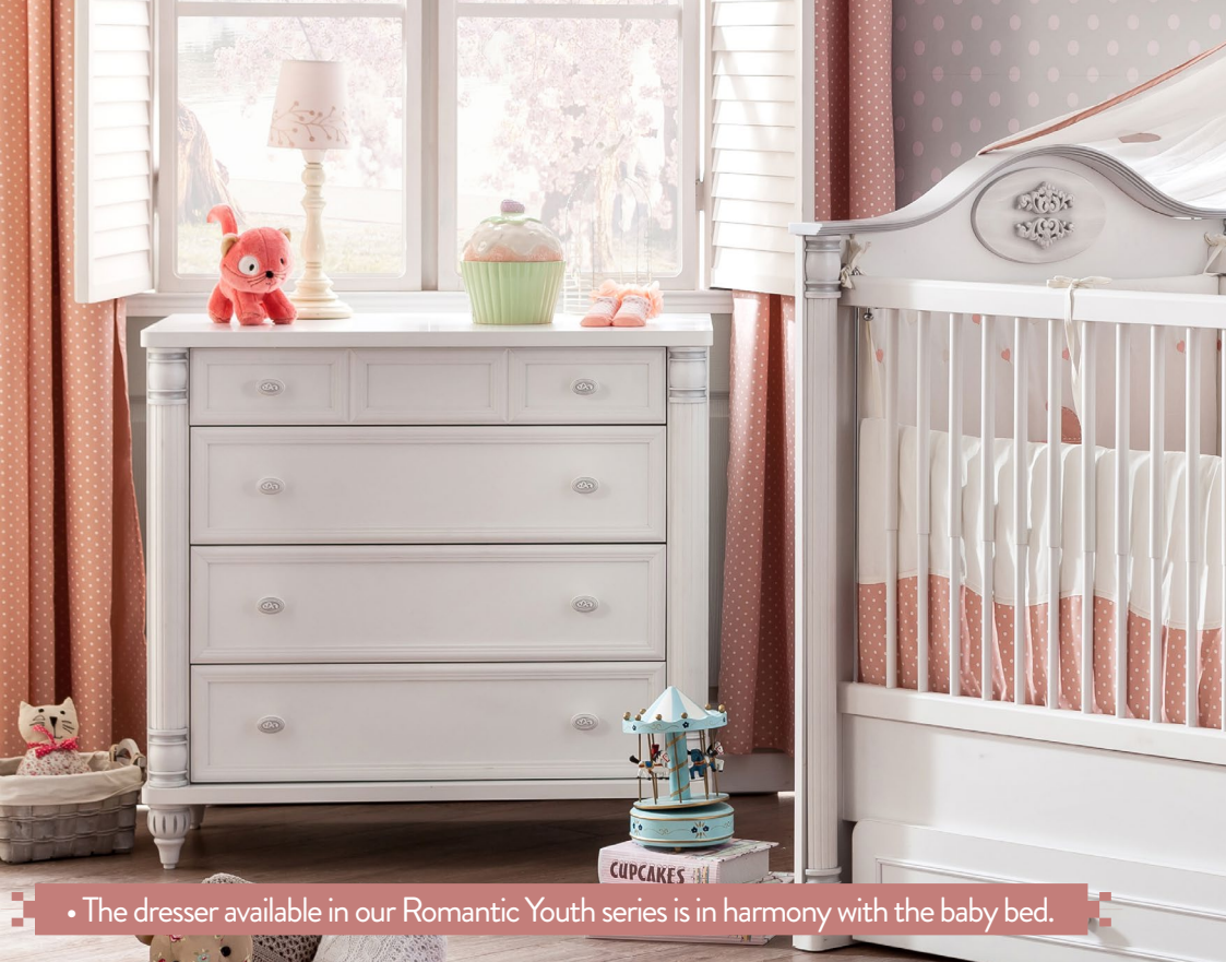
• The dresser available in our Romantic Youth series is in harmony with the baby bed.