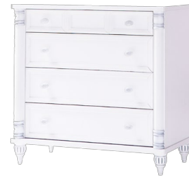
Romantic Dresser W 90 x H 88 x D 49 cm 2 Parcels • 55 kg • 0,298 m 3 20.21.1201.01