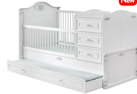
Romantic Convertible Baby Bed (with Parent Bed) (80x180 cm) W 189 x H 117 x D 101 cm 5 Parcels • 135,5 kg • 0,501 m 3 20.21.1015.00