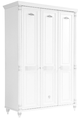
Romantic Large Wardrobe W 140 x H 203 x D 58 cm 5 Parcels • 132 kg • 0,436 m 3 20.21.1002.02