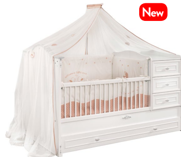
Romantic Canopy W 80 x H 139 cm 1 Parcel • 2,5 kg • 0,033 m 3 20.21.4916.00