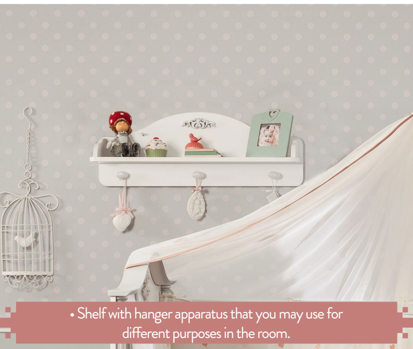
• Shelf with hanger apparatus that you may use for different purposes in the room.