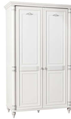
Romantic Medium Wardrobe W 122 x H 203 x D 58 cm 4 Parcels • 117 kg • 0,406 m 3 20.21.1001.00