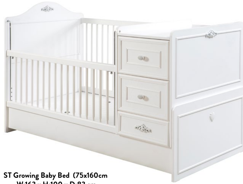
ST Growing Baby Bed (75x160cm