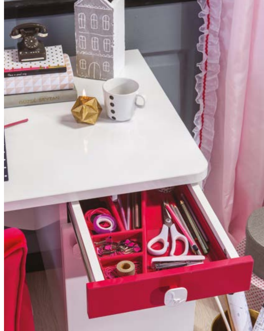
Drawer with pencil holder.