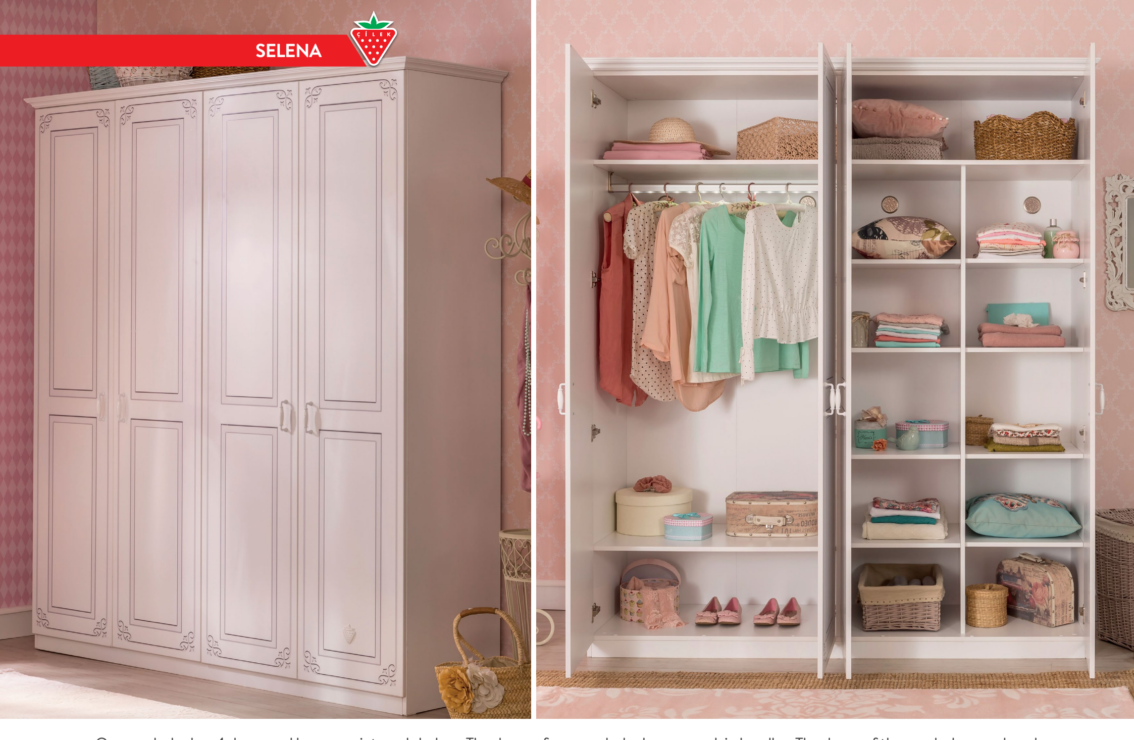
Our wardrobe has 4 doors and has many internal shelves. The doors of our wardrobe have porcelain handles. The doors of the wardrobe are closed softly and silently with brake system with damper, safe against possible trappings. We have illuminated hanger apparatus which illuminates the interior of the wardrobe. Our wardrobes have wall fixing apparatus. Body and doors of our wardrobe was enriched with rustic prints.