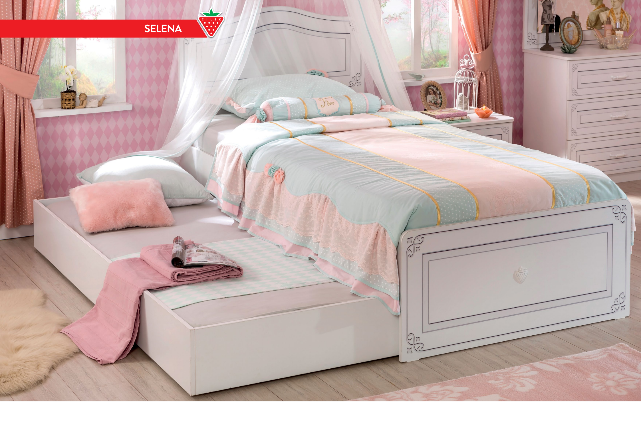
The under bedstead is suitable with bunks and bedsteads of Selena series. It can also be used as item storage.