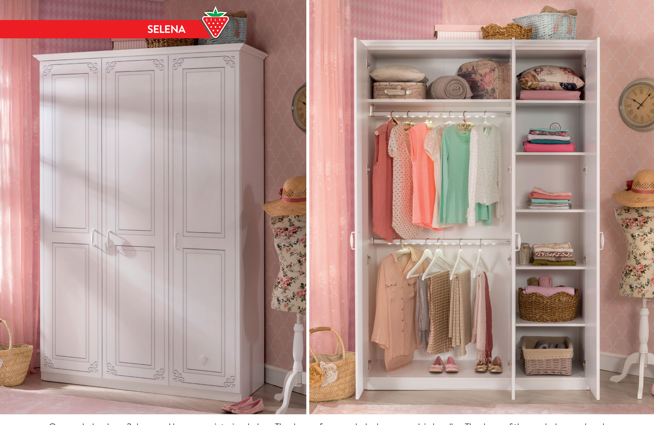
Our wardrobes have 3 doors and have many interior shelves. The doors of our wardrobe have porcelain handles. The doors of the wardrobe are closed softly and silently with brake system with damper, safe against possible trappings. We have illuminated hanger apparatus which illuminates the interior of the wardrobe. Our wardrobes have wall fixing apparatus. Body and doors of our wardrobe was enriched with rustic prints.