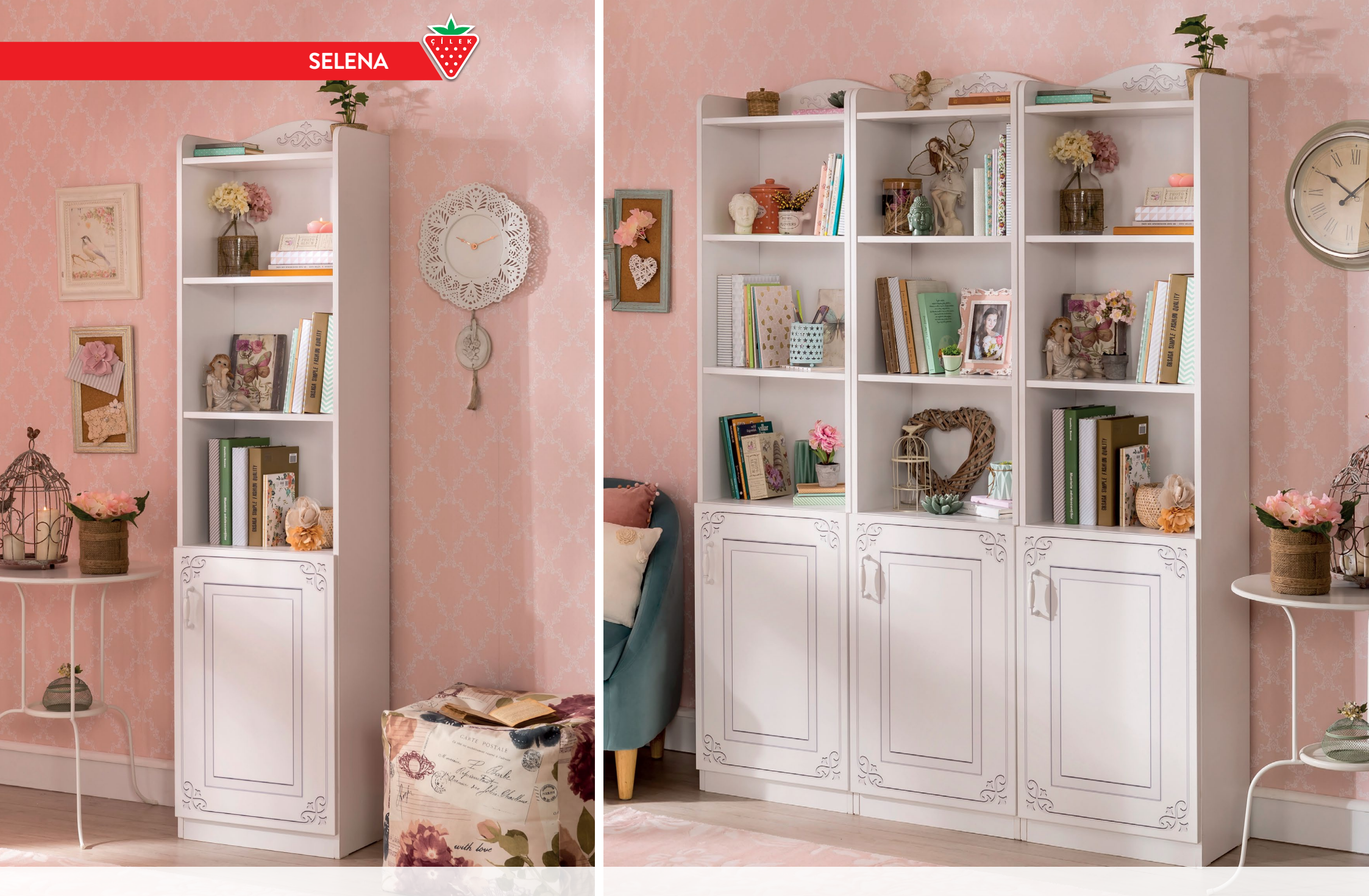
Our bookcase has many shelves. The doors are closed softly and silently with brake system with damper, safe against possible trappings. Our bookcases have wall fixing apparatus. Doors of our wardrobe was enriched with rustic prints.