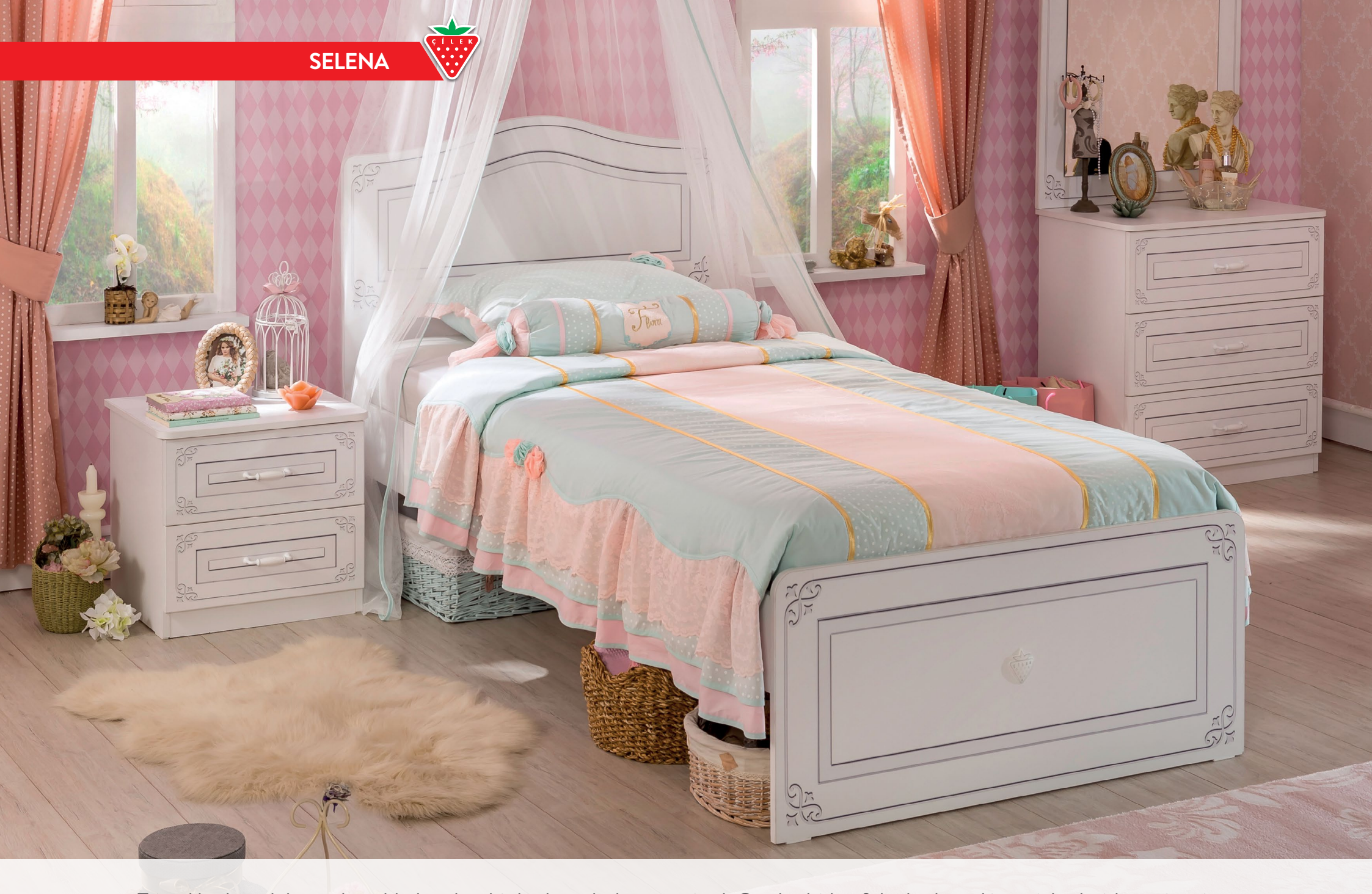
Friend bed module can be added under this bedstead when required. Our bedside of the bedstead is enriched with rustic prints. The Nightstand is suitable with all bedsteads of Selena series. Our shelves are enriched with rustic prints.