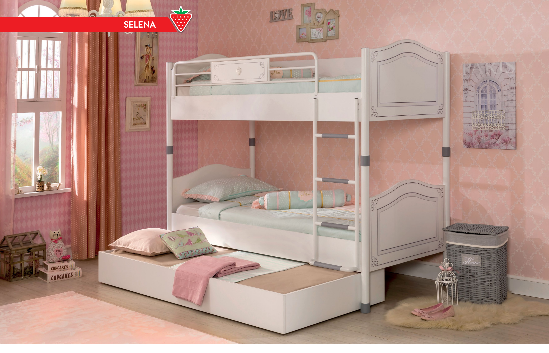
Friend bed module can be added under this bedstead when required as a third bed. Our bunk is enriched and reinforced with metallic and aluminum materials. Our bunk is safe and has TUV certificate. Our bunk is suitable with each room thanks to its moving stairs. Our bunk can be turned into two beds when necessary. Our bedsides were enriched with rustic prints.