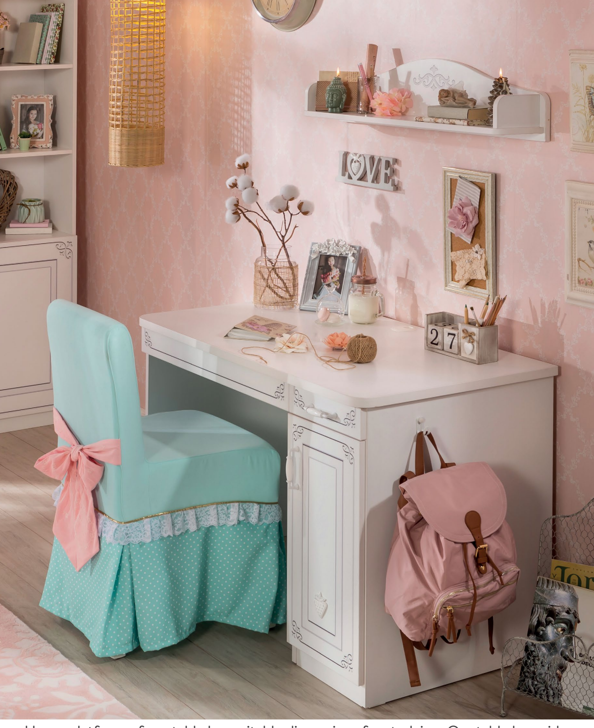
Upper platform of our table has suitable dimensions for studying. Our table has wide drawer for wide projects. There is a handle on the left and right platform to hang bag and items. Working unit module can be mounted on this table when necessary. Our doors and shelves were enriched with rustic prints.