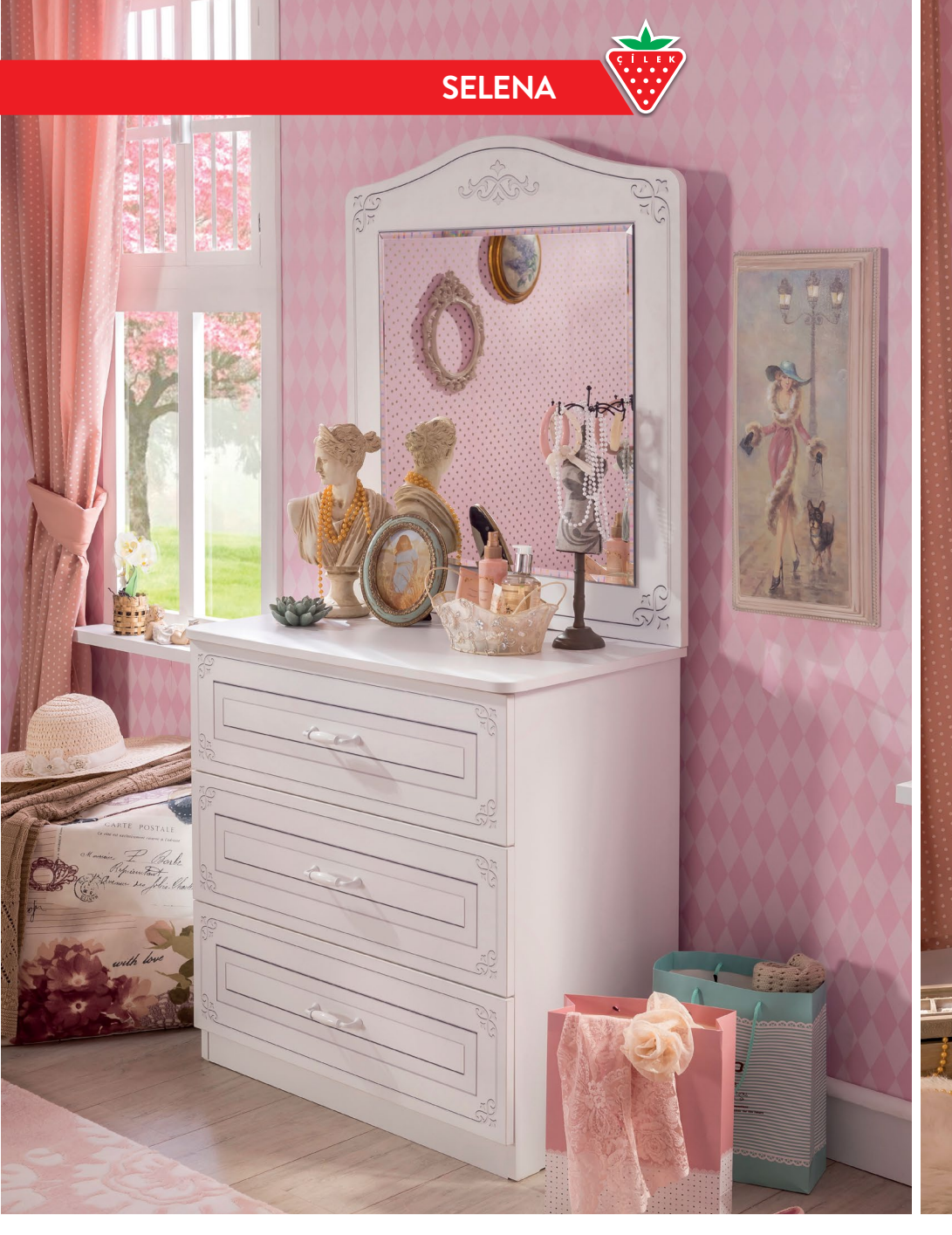
Our dresser has 3 shelves. Each shelve has Porcelain handles. Mirror module can be mounted on our dresser when necessary. Our shelves were enriched with rustic prints.