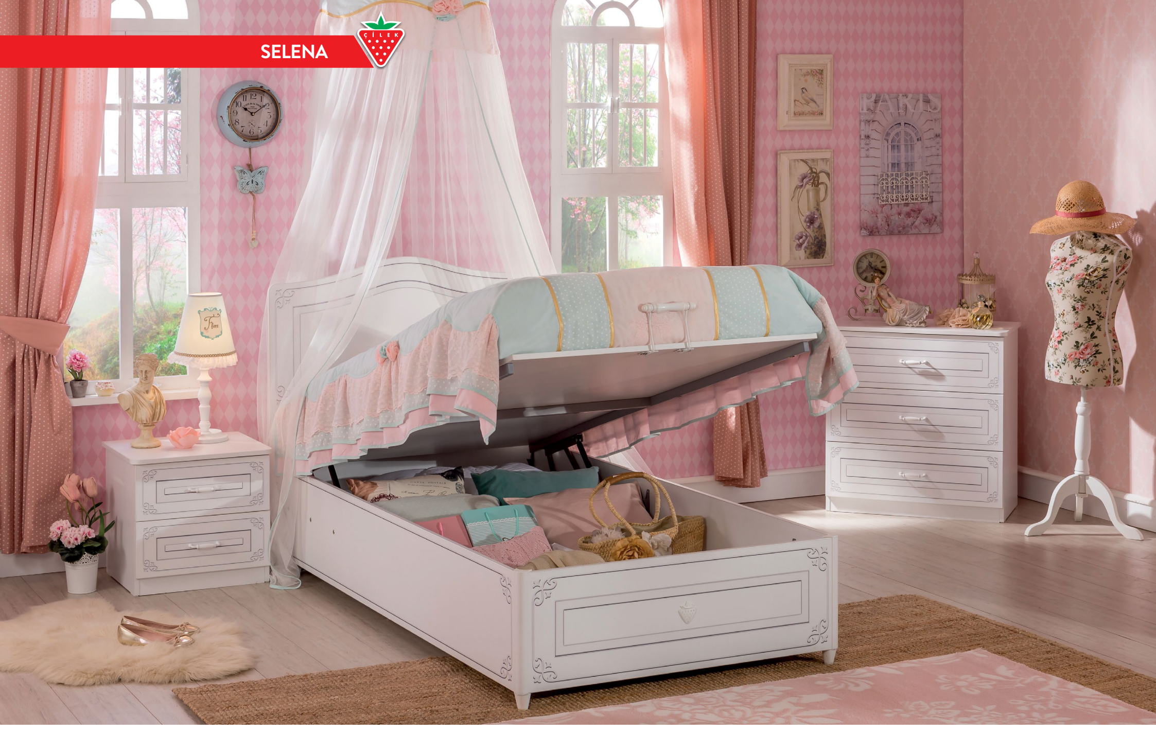
Our bed base is closed softly and silently with brake system with damper, safe against possible trappings. There is an extra security lock on our bedstead. Our bedside of the bedstead is enriched with rustic prints.