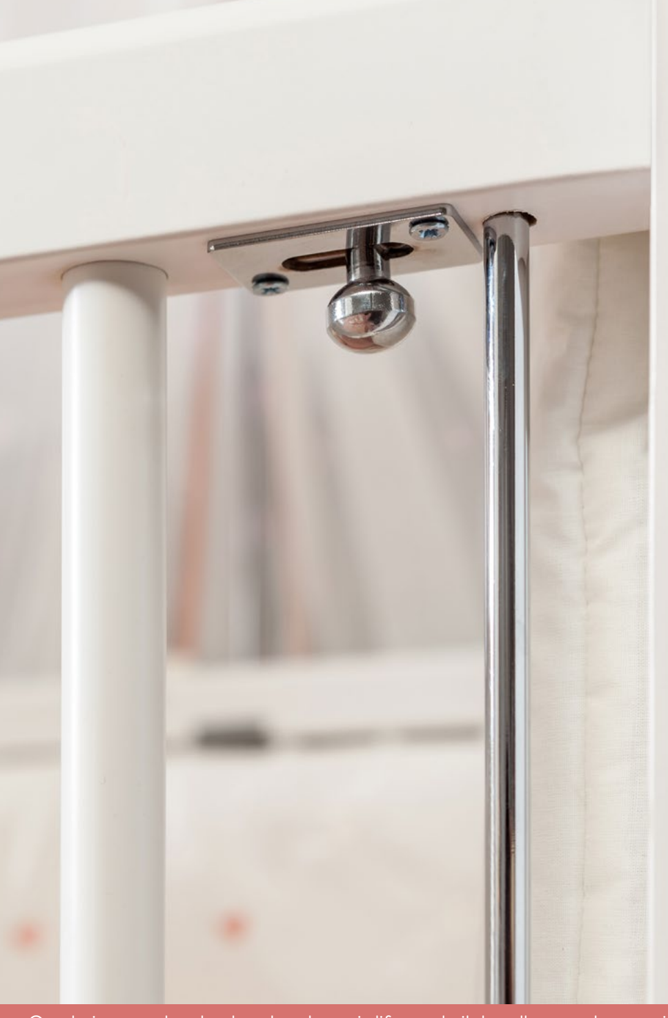
• Our design team has developed a telescopic lift guardrail that allows mothers to pick up their babies from or place their babies in the bed more comfortably.