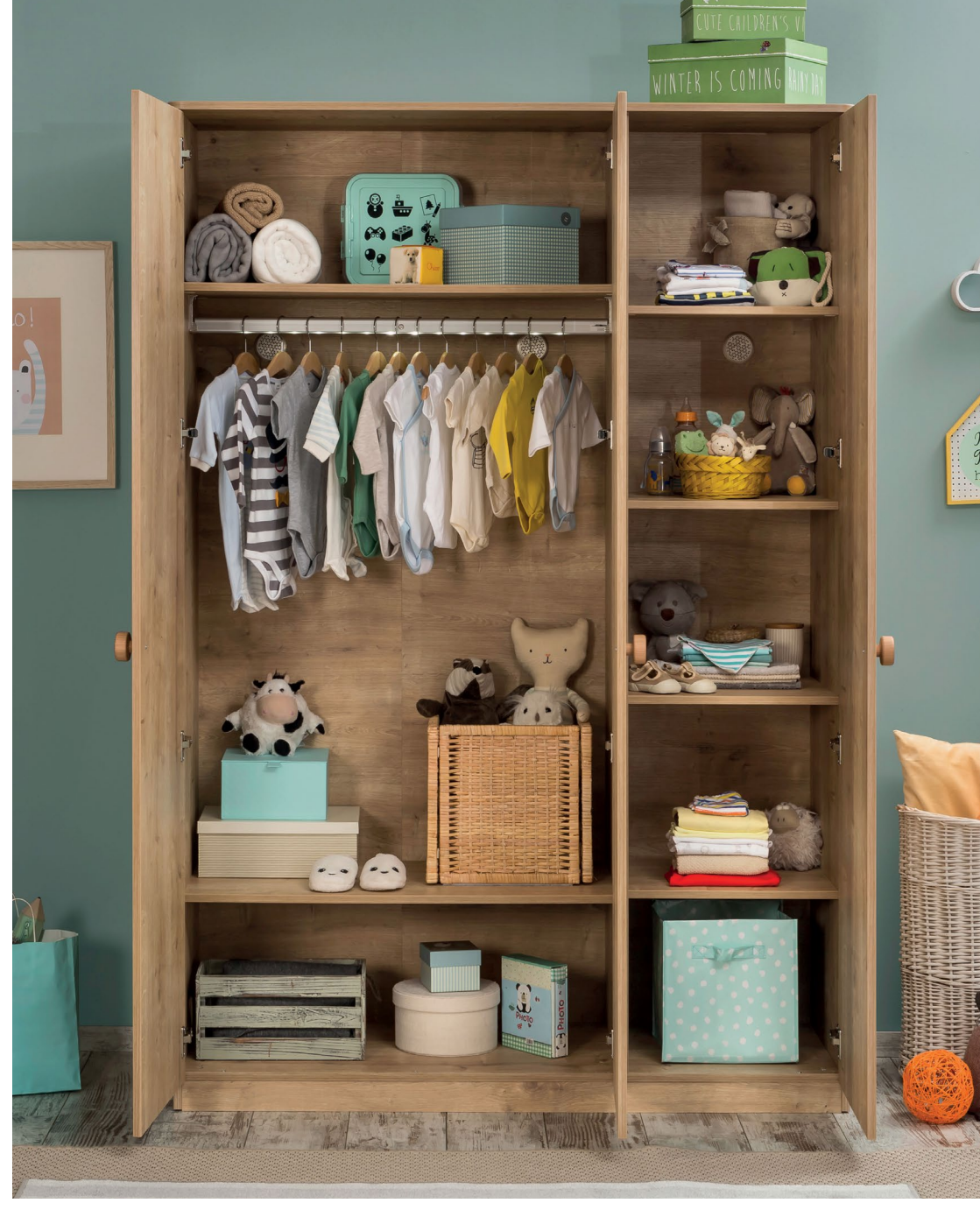
Our wardrobe has 3 doors and has many internal shelves. There are wooden handles on the doors of our wardrobe. Wardrobe doors are closed softly and silently and secure against possible trappings with brake system.