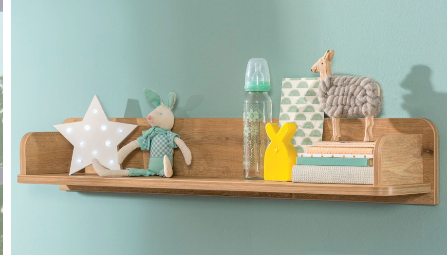
Shelf can be used for different purposes within the room.