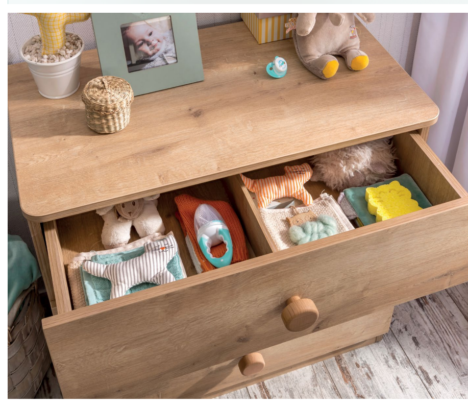
Our 3-drawer dresser has wooden handles. Upper two is partitioned for the baby's things to be organized and separated easily. Interior of our drawers has high volume and has 30 kg storage capacity.