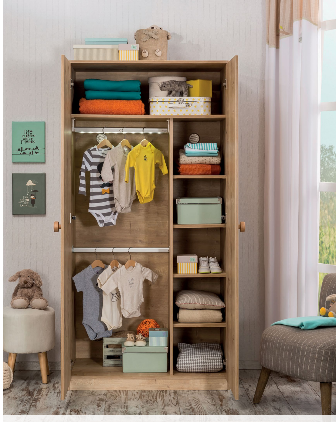
Wardrobe doors are closed softly and silently and secure against possible trappings with brake system